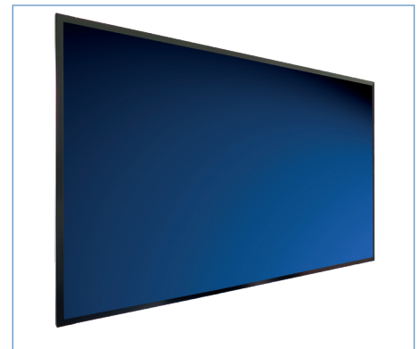
Monitor with safety frame